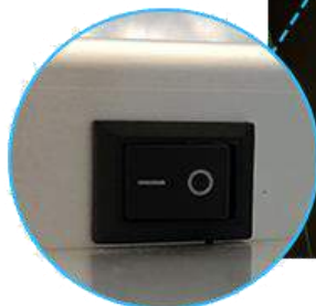
Dual Spectrum Switches