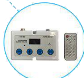
PWM LED Controller (optional)