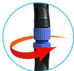
IP67 M15 Waterproof Connector